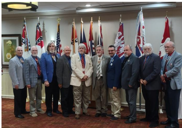
Louisiana Legends, Past Div. Commanders.