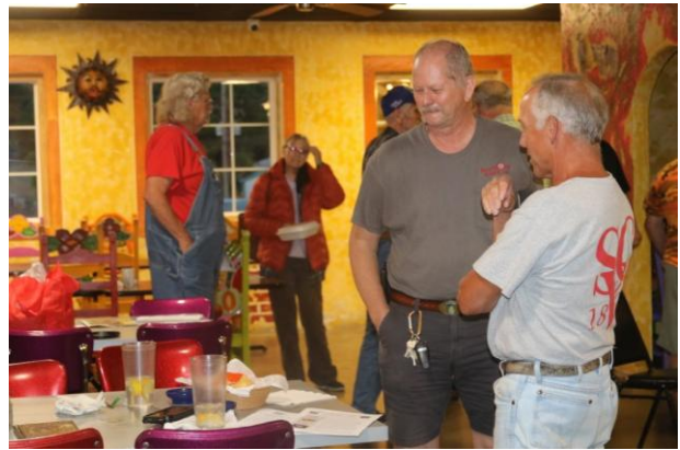
Members enjoyed visiting and eating