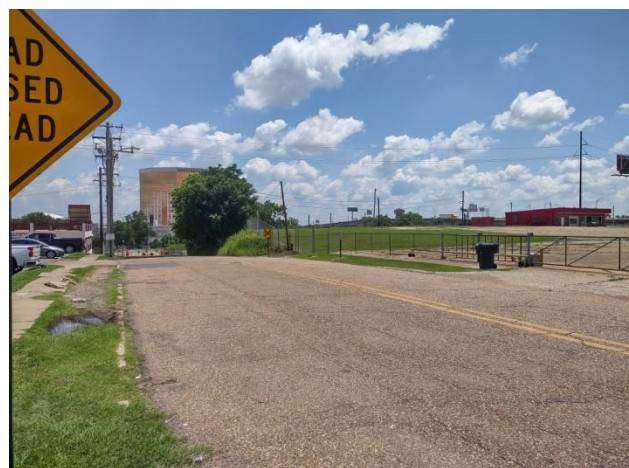
The Horseshoe in background, ATM left of bush