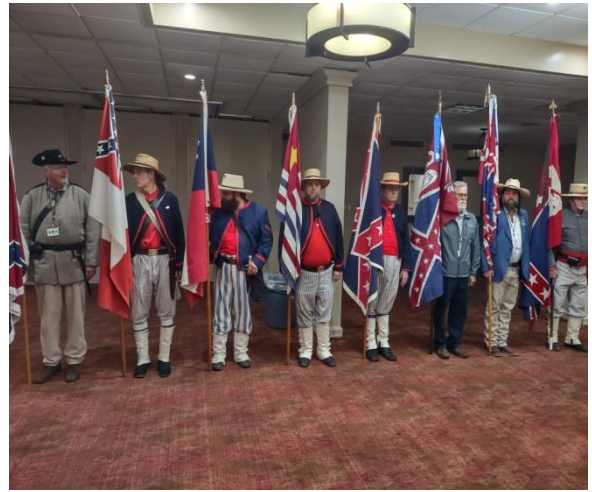
Louisiana Color Guard