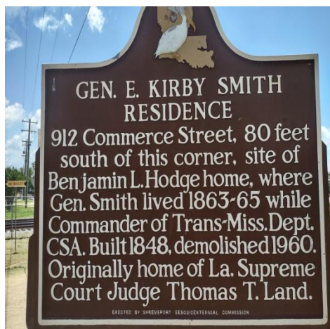
Headquarters of the ATM