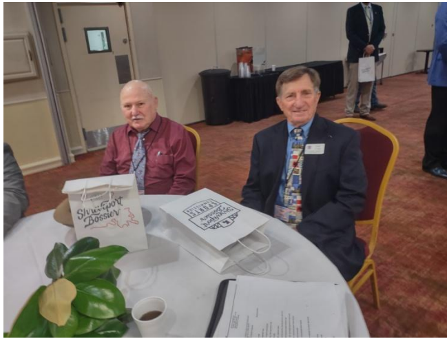
Waiting for Reunion to start