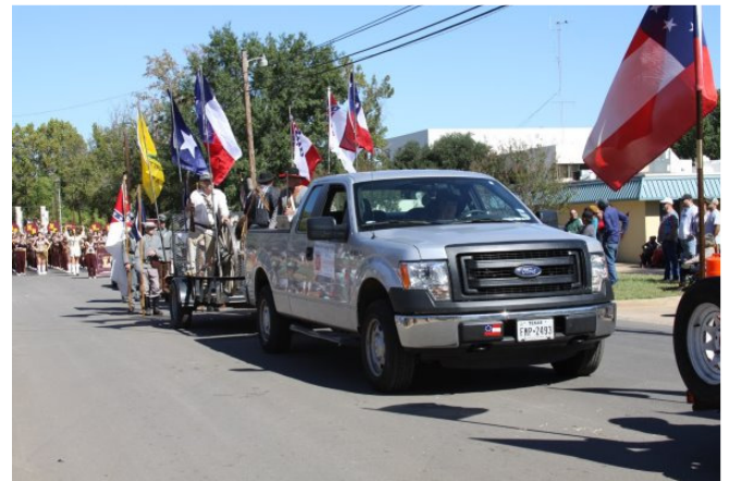
SCV Float in Parade